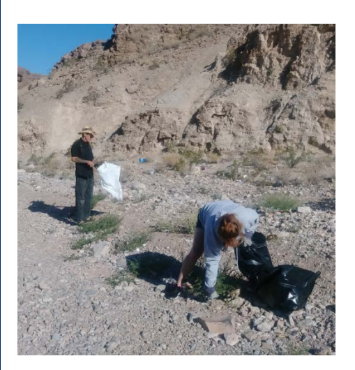
June/July 2018 1<sup>st</sup> & 2<sup>nd</sup> Tuesday